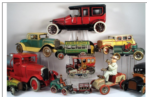
Toys throughout the ages.

If you have any queries or questions about phonics, please do not hesitate to contact the teaching staff.